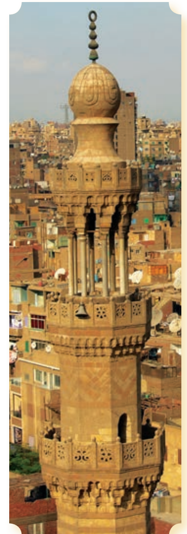
Clockwise: The Minya vision includes children's activities; tower of mosque rises over Egypt.

turmoil engulfed Egypt and the Arab world, concern that these events were distracting God's people from Kingdom priorities brought a new sense of urgency. An action plan was drawn up to focus on training and organizing young people of both city and village churches for outreach.